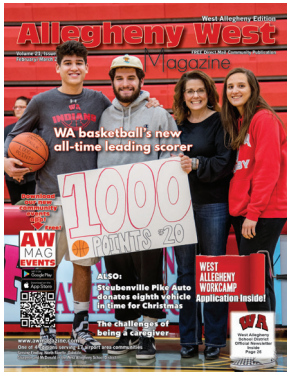
West Allegheny Edition